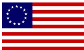
Declaration of Independence

We hold these truths to be self evident. That all men are created equal, that they are endowed by their Creator with certain unalienable rights, that among these are life, liberty and the pursuit of happiness.